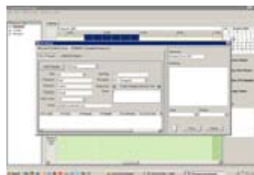
Adding new delegate